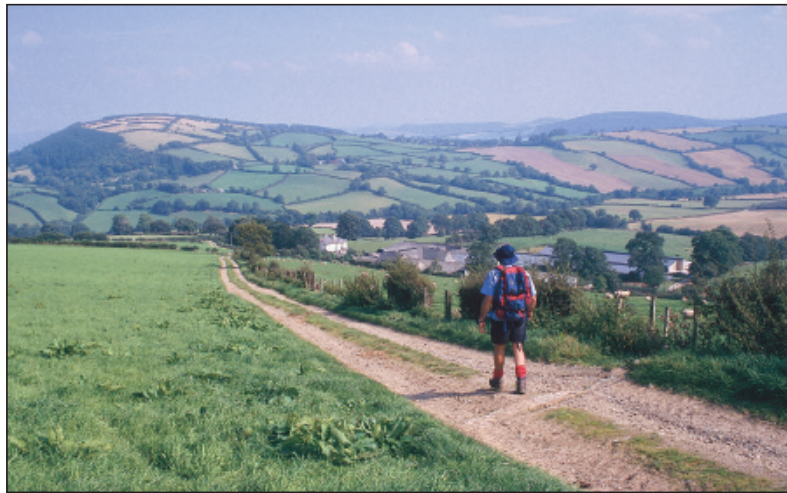
Towards Bryn Hill