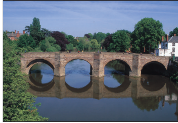
Old Bridge, River Wye, Hereford