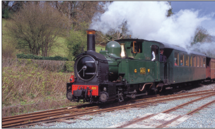
Welshpool and Llanfair Light Railway