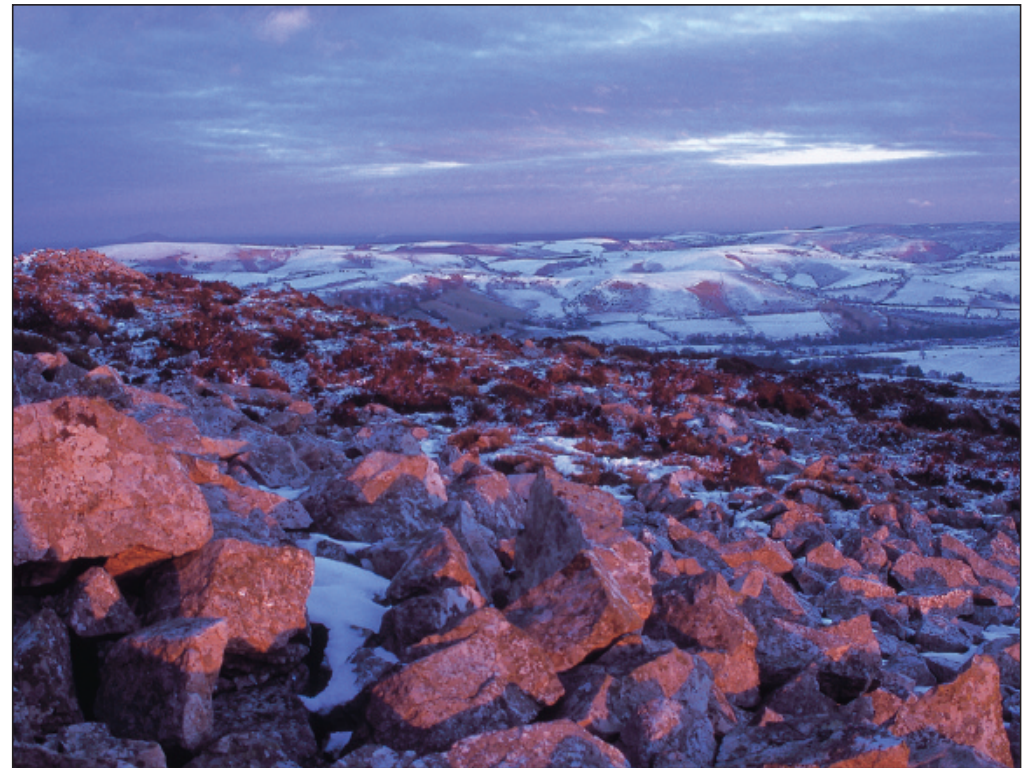
Last light from the Stiperstones